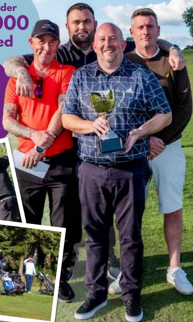
^ Winners of the first Dr Kershaw's Cup