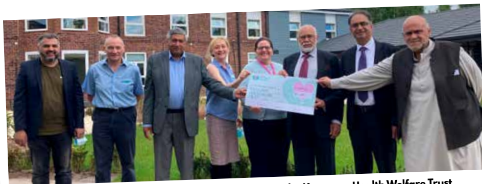
Hospice Team receiving the £2,000 Cheque from the Kasguma Health Welfare Trust

Oldham based, Kasguma Health Welfare Trust, whose key focus is to provide free medical care to the community of Kasguma, Azad Kashmir, recently selected Dr Kershaw's as a local charity to support, with a generous donation of £2,000.